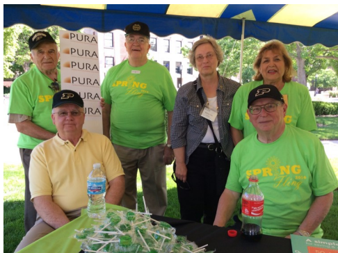
PURA Representatives at 2016 Purdue Spring Fling